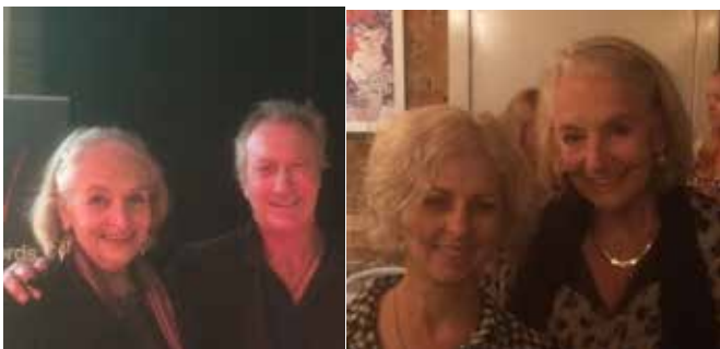
Me with Bryan Brown . . . . . and Kate DiCamillo