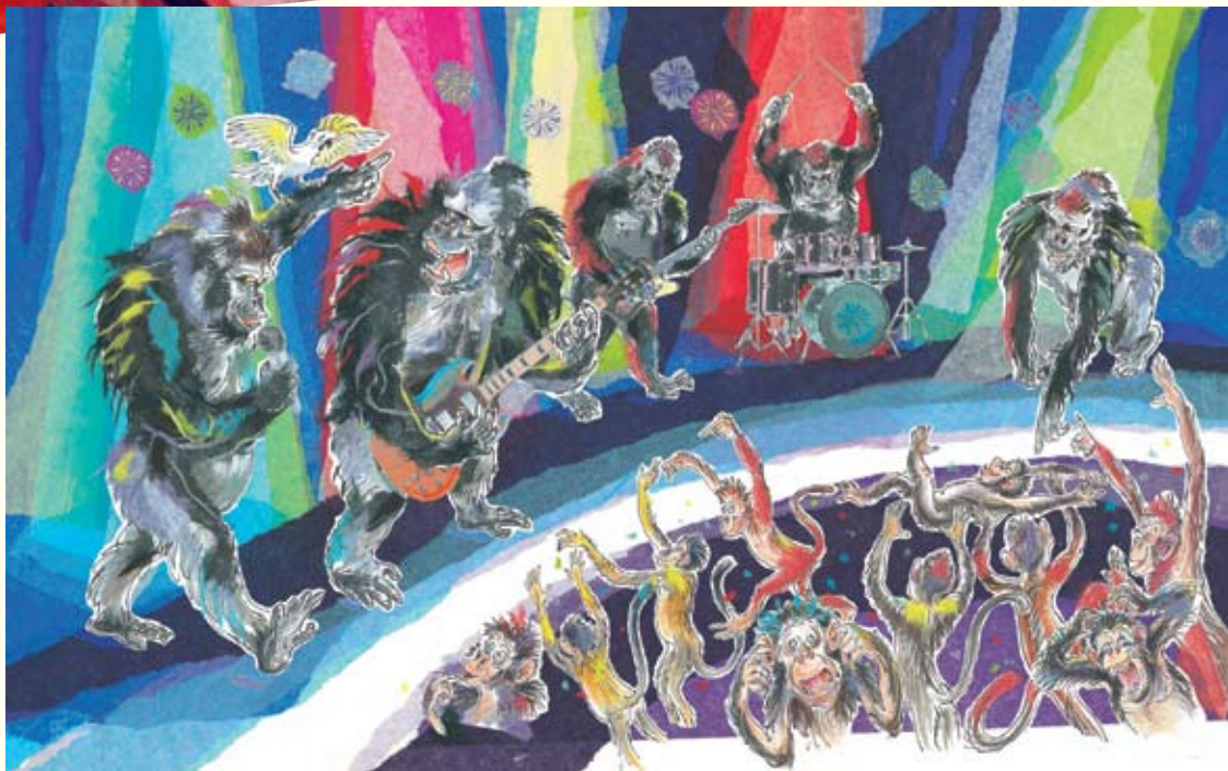
Actual size: 33.5cm x 56.5cm (plus white border approx 4cm all round)