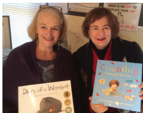
Hamming it up together!