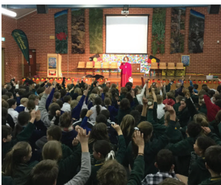
Full house at Blackheath Public School