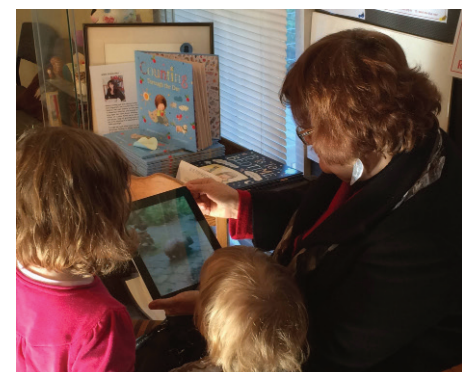
Sharing wombat stories with readers.